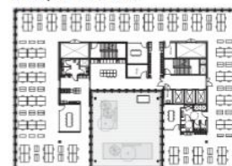
Floor plan for 1 st to 2 nd