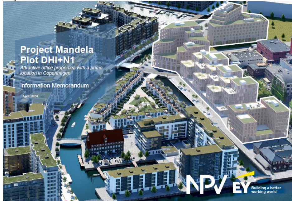
N1 - The Powerhouse