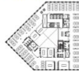
Floor plan for 1 st to 3 rd